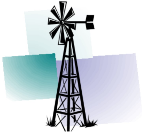
Murilla Community Centre